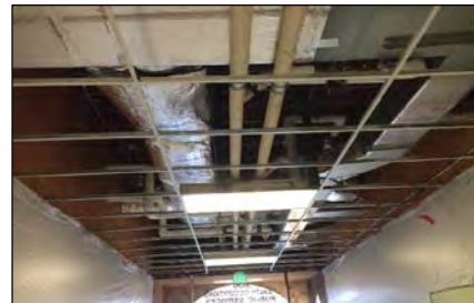
Buildings 800 and 1500 had work done over the winter break