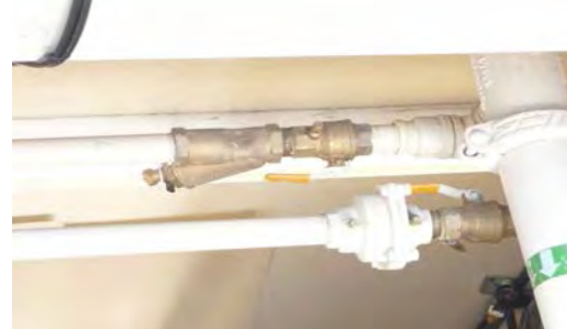
Vallejo Center control valves