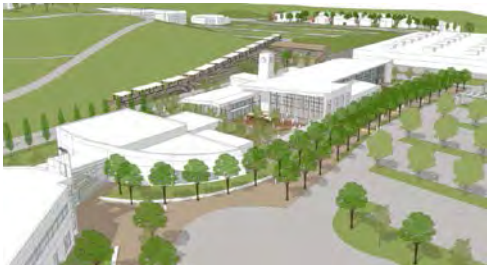
Facilities Master Plan Vallejo Preliminary Rendering