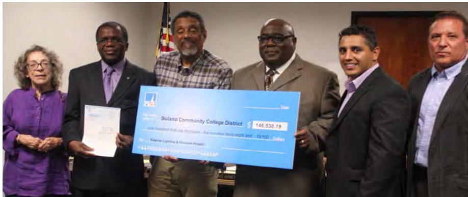
District received a PG&E Rebate Check for this project