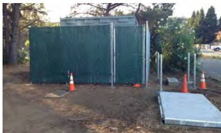
Fencing at Switchgear has been installed