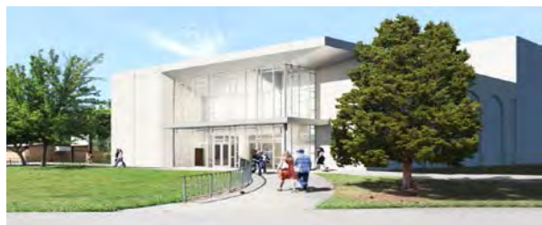
Current design rendering of Building 1200 Theater exterior