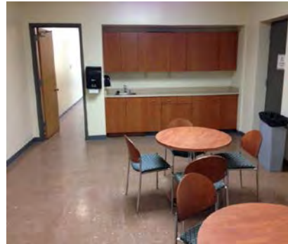
B100 Staff Lounge Room