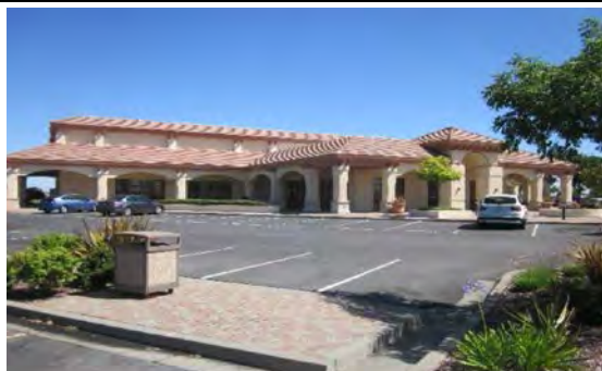
Vacaville Annex Building

1. First phase of the project included providing furniture and equipment required to meet the academic program needs currently housed in this building. This phase is complete. 2. With building purchase now complete, District is moving forward with needed building assessment to meet DSA certification. 1/21/15 Board meeting to approve contract for building assessment study. Once contract is approved, design team will initiate their assessment work including surveying of the existing building. Assessment to be complete in March, 2015 and will serve as basis for Design work.