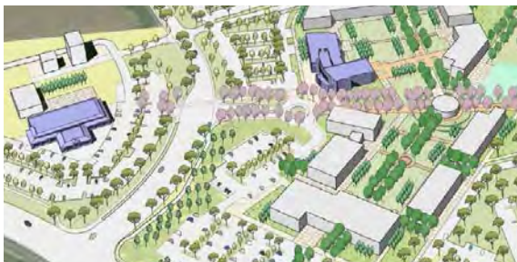
Existing Vacaville Center