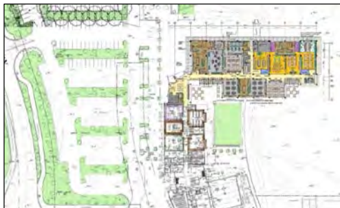
Biotechnology Building Updated Site Plan