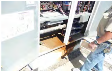
Control valve connections