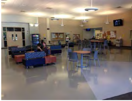
Building 1400 Student Lounge