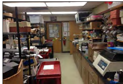
Physics Lab Prep Room