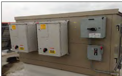
New VFDs have being installed on Building 1700