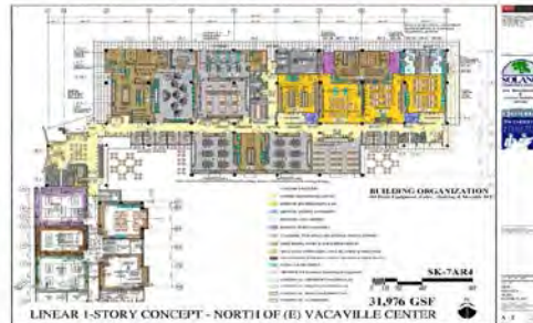
Building floor plan