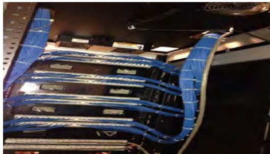
Typical IDF Room