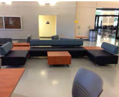
Building 1400 Student Lounge

Next 90 Days 1. Completion of small projects with expenditures of $50,000 or less part of the overall Small Capital Projects scope and budget.