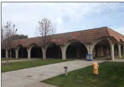
Exterior Building 300