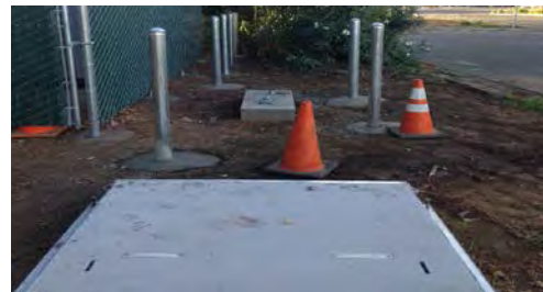
New vault lid and bollards have been placed