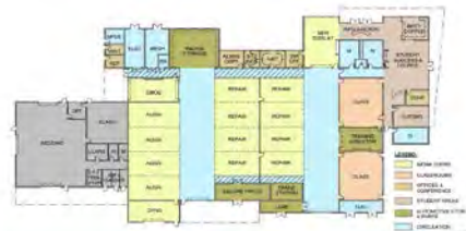
1.A. PRELIMINARY APPROVED PLAN A/E: LIONAKIS (CRITERIA) CONTRACTOR: SWINERTON