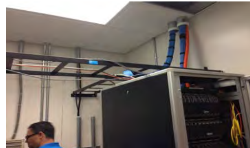
Typical IDF Room