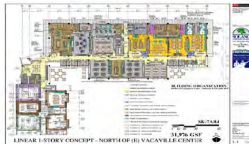
Building floor plan with connection to the existing Center